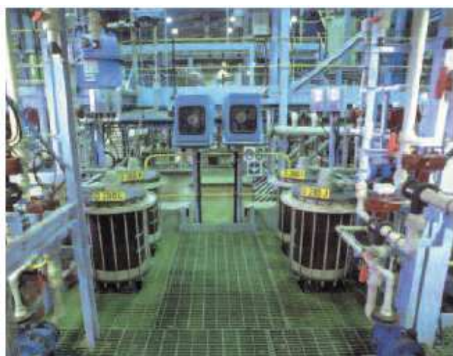
Palladium circuit at Impala Platinum Limited-Refineries, RSA, showing the MRT columns.

Industrial applications for IBC's SuperLig/MRT platform in the PGM space are well proven with platinum, palladium and rhodium recovery from spent automobile catalytic converters resulting in high-purity products, improved recoveries, reduced processing costs and metal lock-up. The other application has been palladium separation and purification in PGM refineries resulting in reduced processing time and costs, increased palladium separation efficiency and recovery and reduced environmental impact. It has also been applied to rhodium refining.